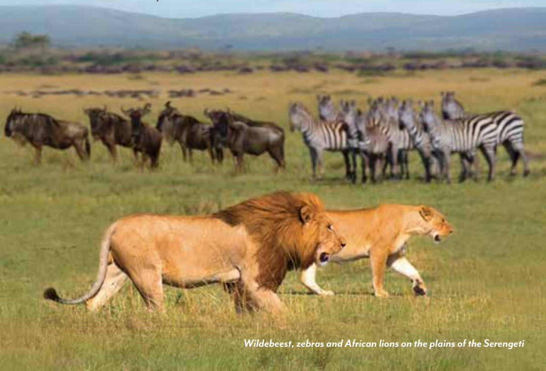
Wildebeest, zebras and African lions on the plains of the Serengeti

Front cover: Leopard in a tree in Tanzania