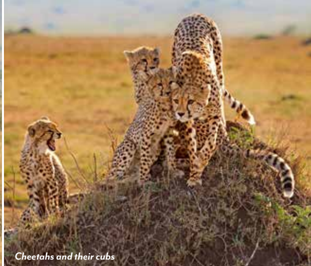
Cheetahs and their cubs