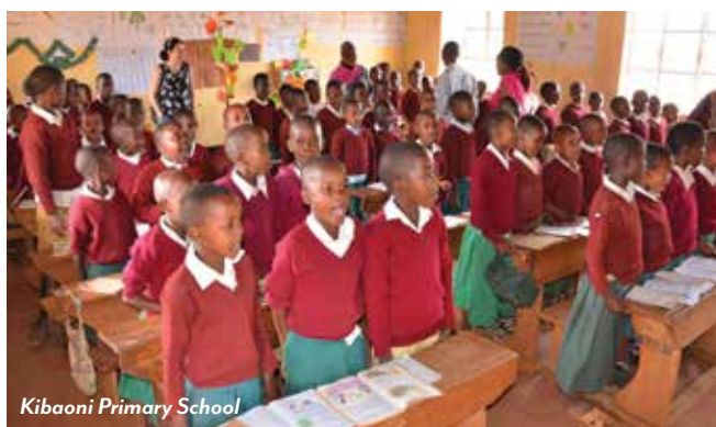
Kibaoni Primary School

punctuates this thrilling full day of game tracking. Later, survey the crater and abundant wildlife from your lodge's viewing terrace, right on the crater's rim. (B,L,D)