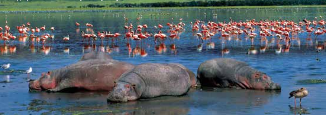
Hippopotamus and flamingos in Ngorongoro Crater