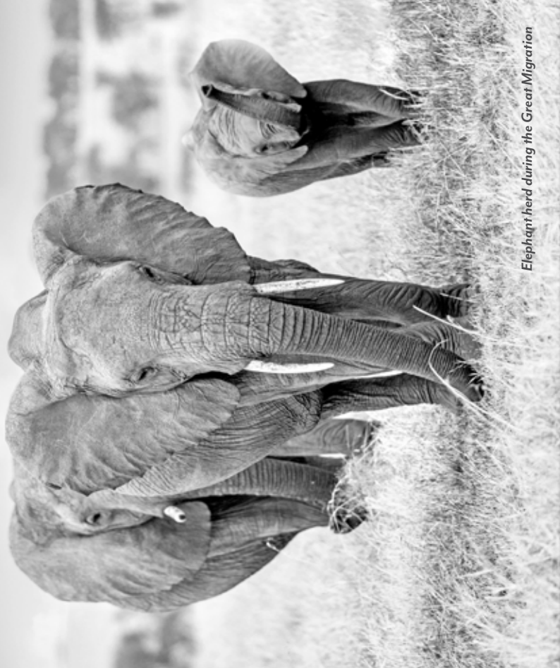
Elephant herd during the Great Migration

PRSRRT STD U.S. Postage PAID Gohagan & Company