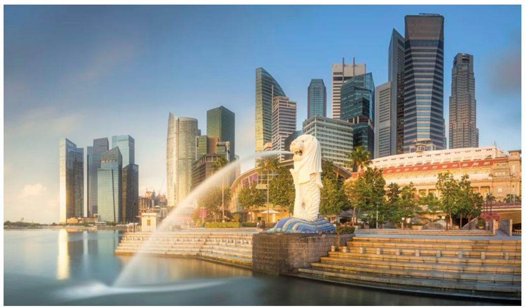
Merlion Park, Singapore