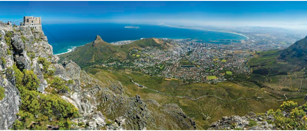
Table Mountain overlooking Cape Town