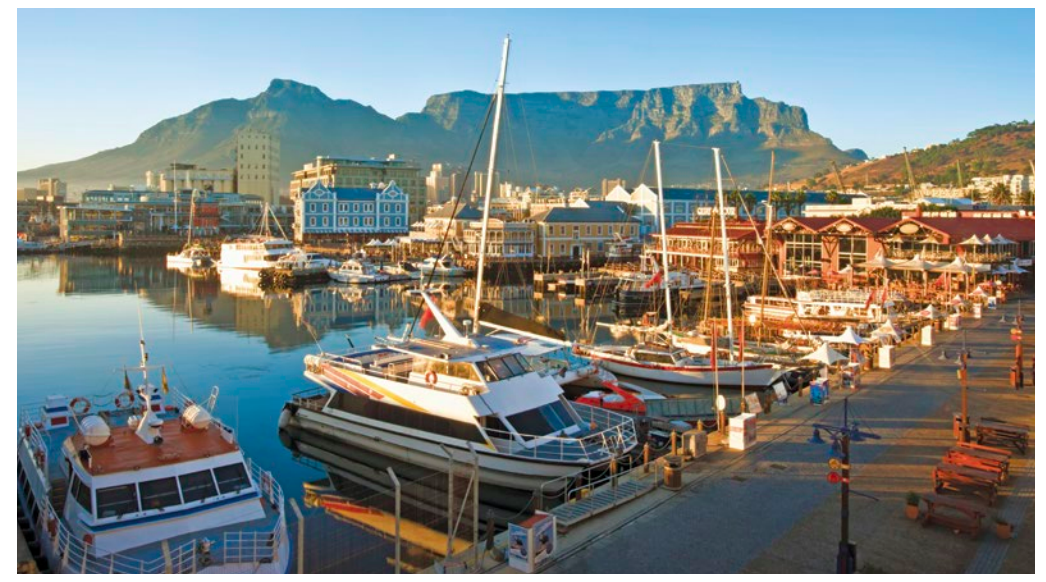
Victoria & Alfred Waterfront, Cape Town