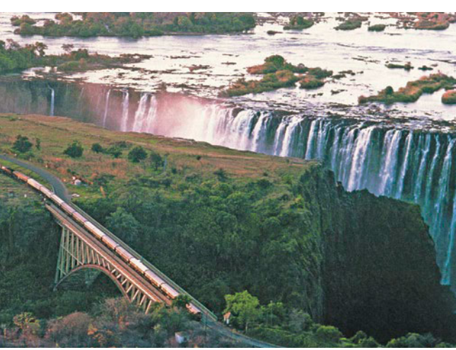
Rovos Rail, Victoria Falls