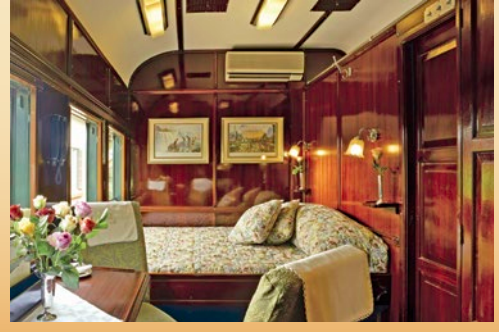
Deluxe Suite with a double bed and a lounge area

Discover the glamourous Golden Age of train travel aboard the luxurious Rovos Rail. Revel in the incredible attention to detail and lavish offerings while riding in vintage carriages, restored to mint condition and impeccably appointed. Spend your days in the Observation Car or mingle with your fellow travelers in the lounge. On-board chefs prepare traditional dishes and regional specialties with only the finest of ingredients. Enjoy sumptuous breakfasts each morning and delicious three-course lunches and dinners, featuring fine South African wines.