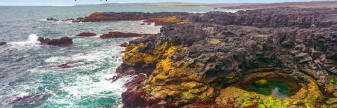
Brimketill natural water pool in Reykjanes Peninsula

Enjoy a scenic drive to Siglufjörður, the northern most town on the mainland. Located 28 miles from the Arctic Circle, this picturesque area — tucked between rugged mountains at the tip of the