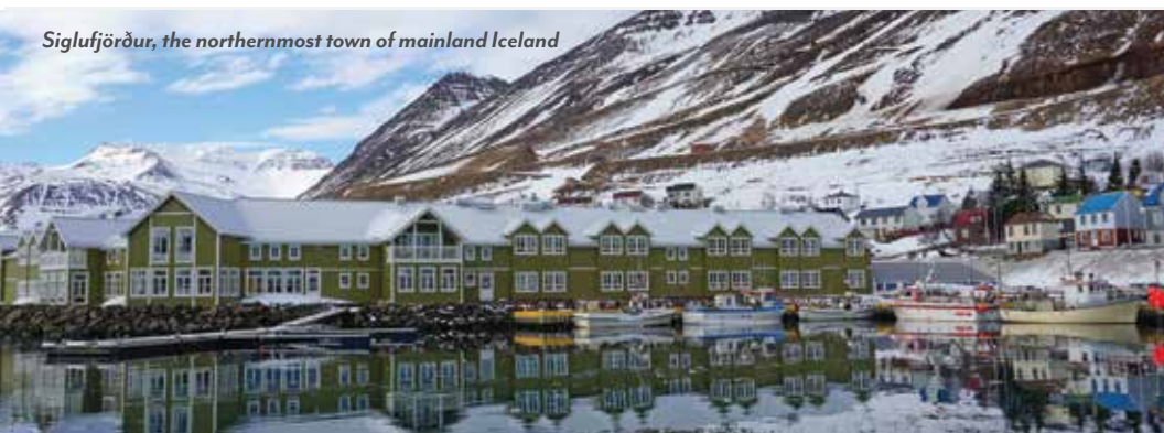
Siglufjörður, the northernmost town of mainland Iceland

Transfer to the airport for your flight back to your home city. (B)