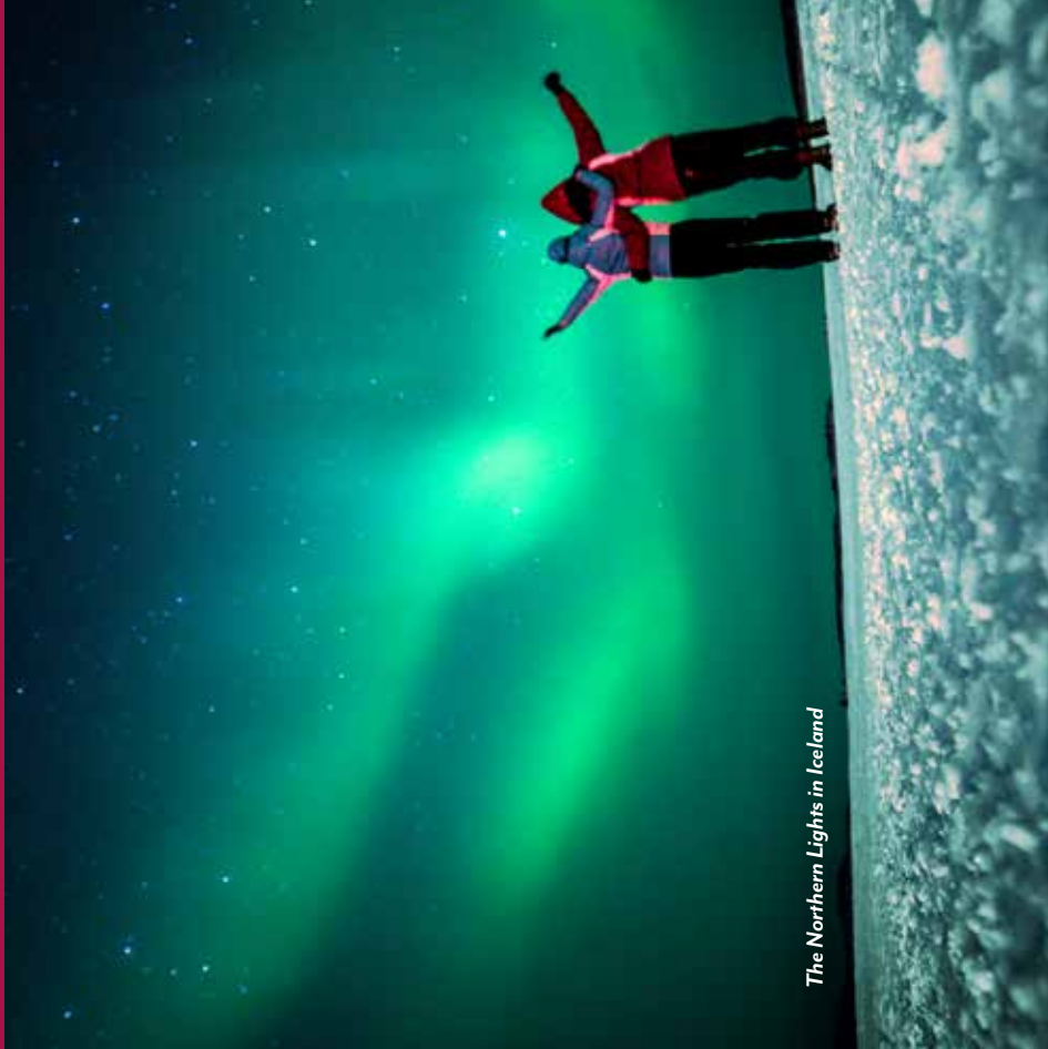
The Northern Lights in Iceland

PRSRRT STD U.S. Postage PAID Gohagan & Company