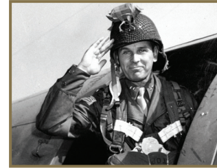
Maj. General Maxwell D. Taylor, commanding officer of the 101st US Airborne Division, September 17, 1944