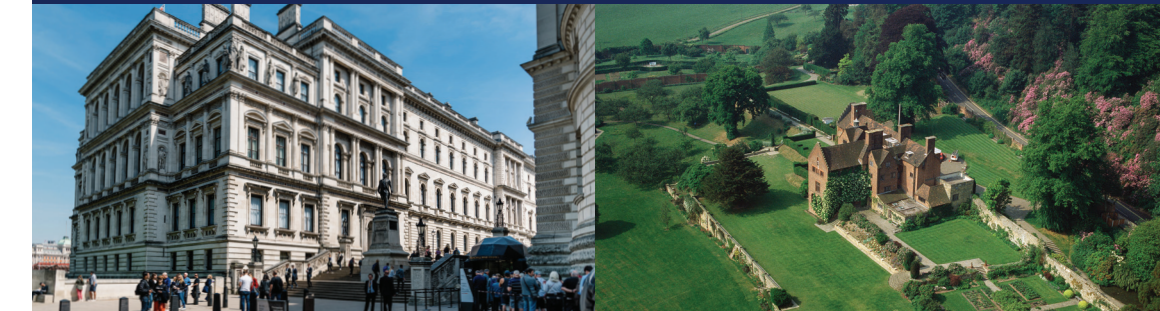
Churchill War Rooms

*$129 per person taxes & fees are additional.