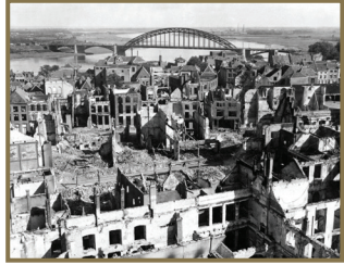
Bridge over the Rhine, Nijmegen

Hear their stories. Learn their names. Stand where history was made.