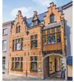
De Halve Maan Brewery, est. 1856, Bruges