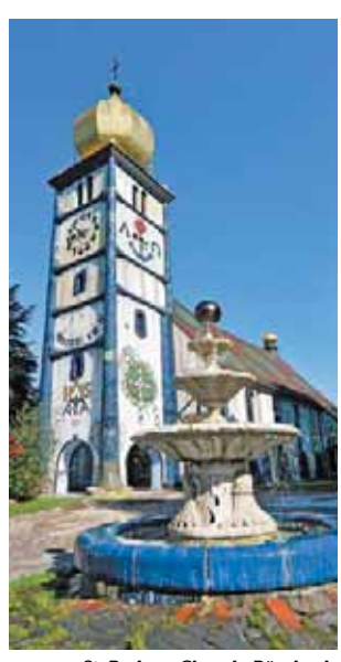
St. Barbara Church, Bärnbach