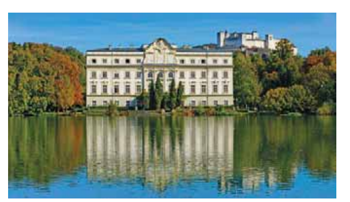
Leopoldskron Palace, one of the filming locations of "The Sound of Music"