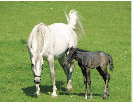
Lippizaner mother & foal

Free Time: Explore the area a bit and choose among the wide selection of restaurants in Salzburg, from refined contemporary or classical Austrian cusines to casual fare at a café or beer garden.