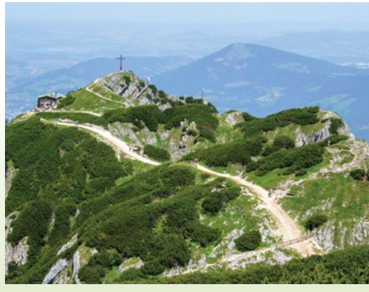
Eagle's Nest, Mount Kehlstein

Hohensalzburg Fortress. Visit the largest fully preserved castle in Central Europe, perched high about the rooftops, to admire panoramic views of the city from Hohensalzburg Fortress.