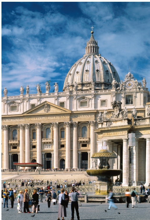
We visit St. Peter's Square and Basilica on Day 7.

Day 14: Tuscany/Venice Leaving Tuscany today, we travel through the Veneto region to Venice, which, along with its lagoon, is a UNESCO site. We arrive early this afternoon; the remainder of the day is free to explore this wondrous city on our own. B