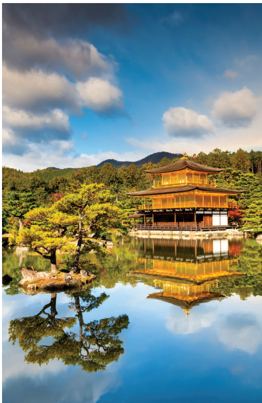
We visit Kyoto’s Temple of the Golden Pavilion on Day 10.