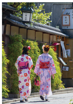
Geishas in traditional dress

Day 11: Kyoto More of Kyoto is on tap today, beginning with a visit to the otherworldly Arashiyama Bamboo Grove; the Kyoto Museum of Traditional Crafts (Fureaikan), showcasing all of Kyoto’s 74 different métiers in one place; and Nijo-jo Castle (c. 1603), the extravagant residence and fortifications of the shoguns who ruled Japan for more than 250 years. Then the remainder of the day is free for independent exploration in this traditional, yet modern city before we gather for dinner together tonight. B,D