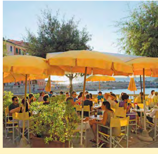
Seaside dining in Vernazza