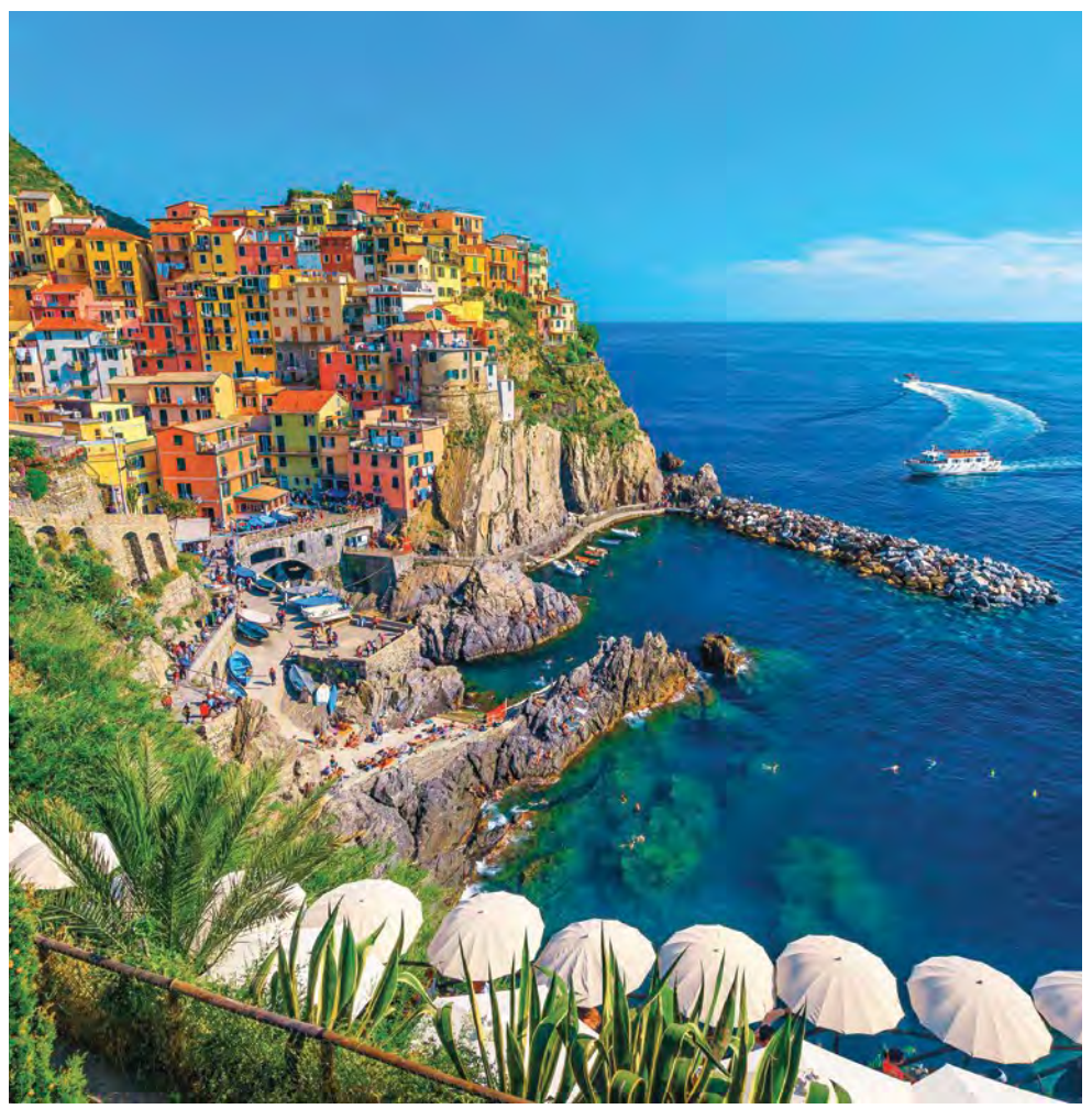
Manarola, Cinque Terre