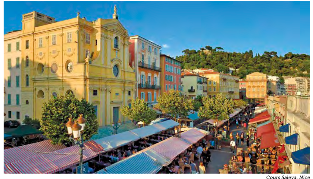
Jours Saleya, Nice