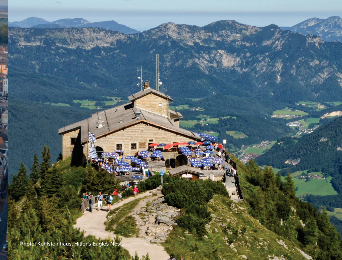
Photo: Kehlsteinhaus, Hitler's Eagle's Nest.