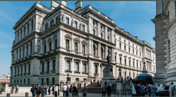
Churchill War Rooms

*$129 per person taxes & fees are additional.