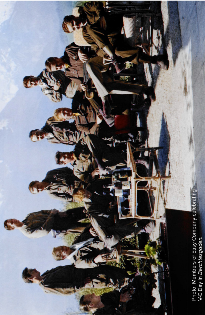
Photo: Members of Easy Company celebrating V-E Day in Berchtesgaden.

The National WWII Museum 945 Magazine Street New Orleans, LA 70130