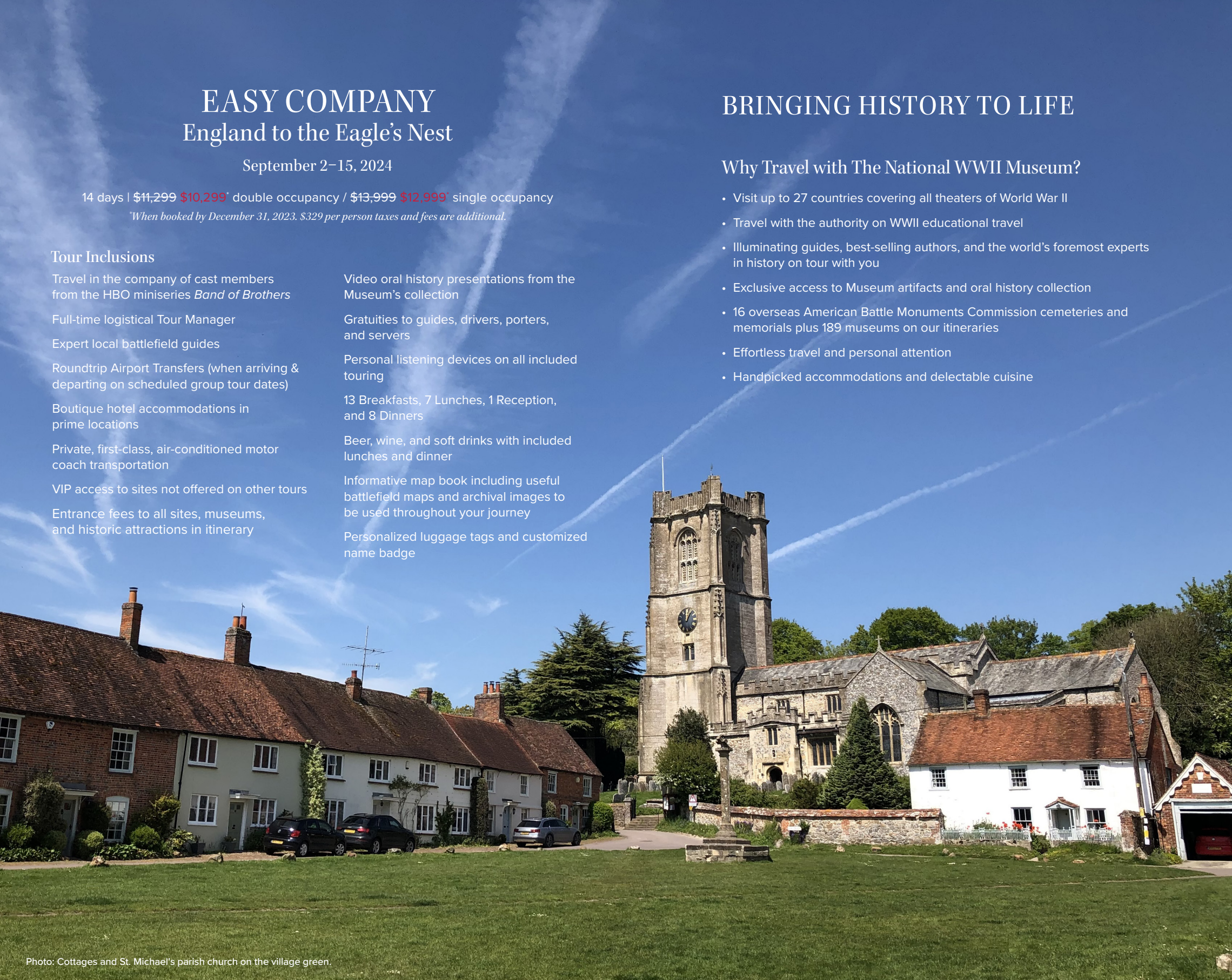
Photo: Cottages and St. Michael's parish church on the village green.

This outstanding itinerary is brought to you by the Texas Exes Flying Longhorns travel program, which supports the association's mission of promoting and protecting The University of Texas at Austin and uniting its alumni around the world. While you do not have to be an alumnus of UT to travel with us, we do ask that all Flying Longhorns travelers have an active membership in the Texas Exes. Memberships start at just $60.