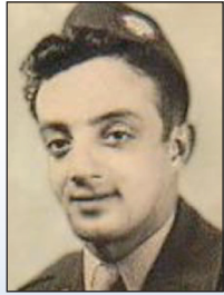
T-4 George Luz Portrayed by Actor Rick Gomez