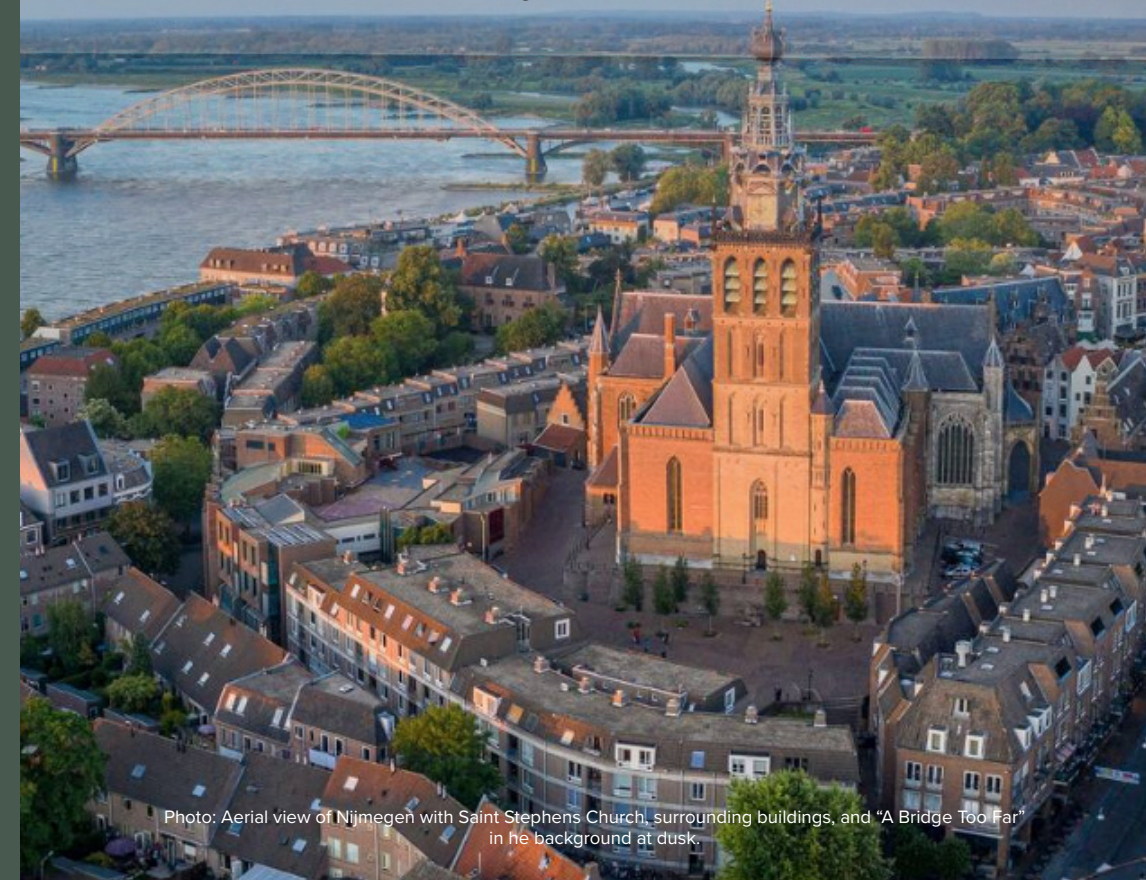
Photo: Aerial view of Nijmegen with Saint Stephens Church, surrounding buildings, and "A Bridge Too Far" in the background at dusk.