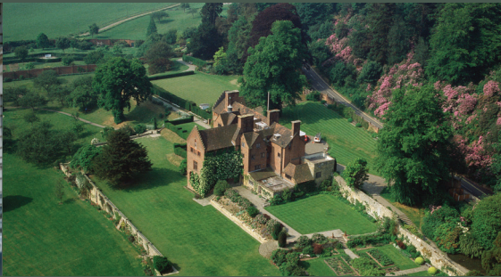
Aerial view of Chartwell, home of Sir Winston Churchill