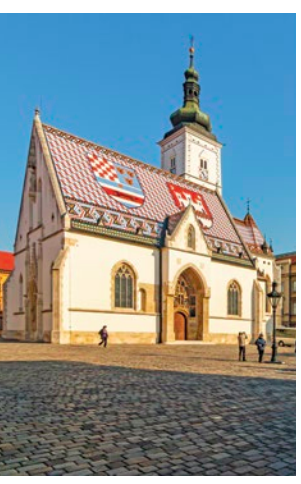
St. Mark's Church, Zagreb