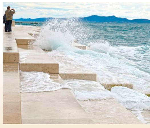
Sea organ, Zadar