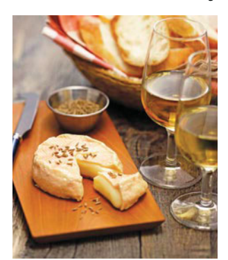
Wine and cheese, Alsace