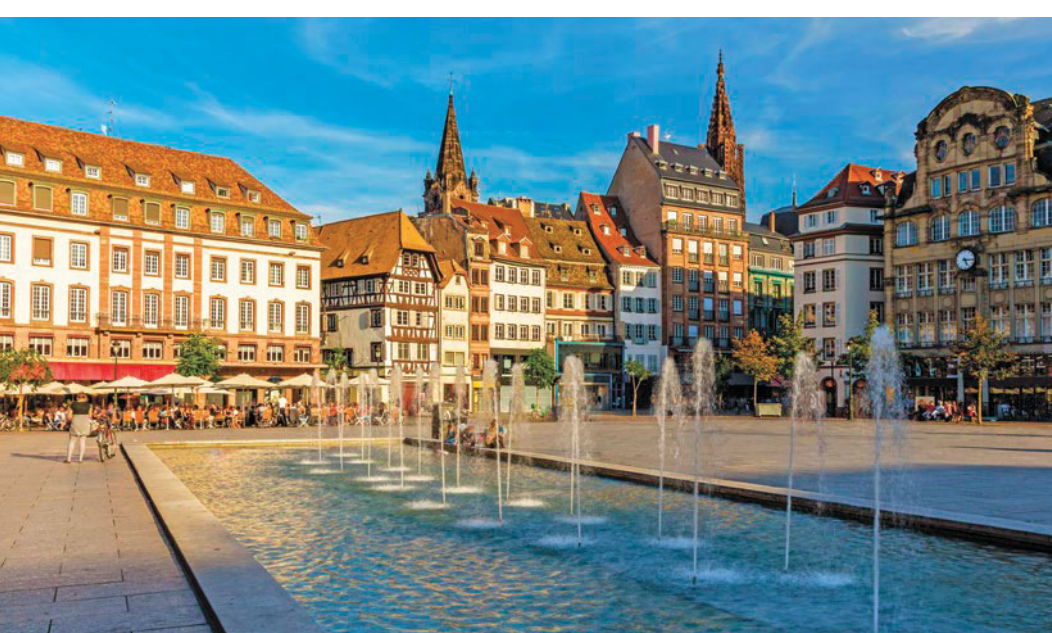
Place Keber, Strasbourg

see Kammerzell House, known for its wooden sculptures depicting secular and sacred scenes. Your guide shares details about the city's history and culture, including background into "La Petite France." Originally home to tanners, fishermen and millers, this district brims with cobbled streets and waterfront gathering spaces. See a different side of Strasbourg during a panoramic canal tour. Cruise by the UNESCO-listed Neustadt district, the tanners' quarter, the European Quarter and more.