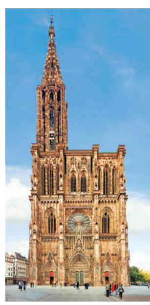
Notre-Dame Cathedral, Strasbourg