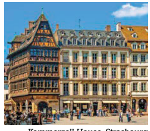
Kammerzell House, Strasbourg