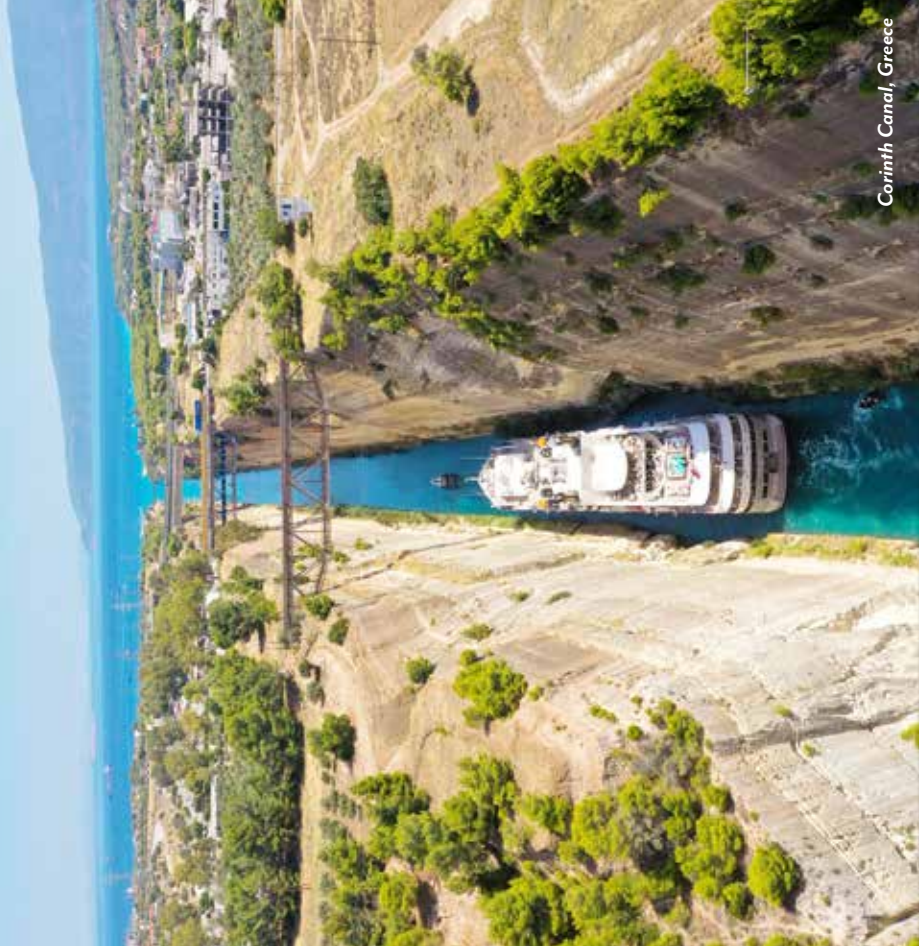
Corinth Canal, Greece

PRSRRT STD U.S. Postage PAID Gohagan & Company