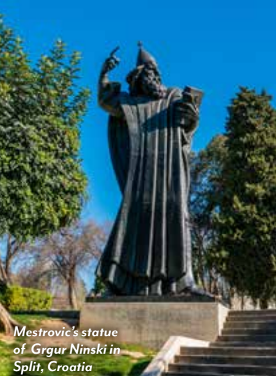
Mestrovic's statue of Grgur Ninski in Split, Croatia