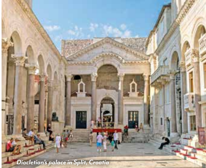
Diocletian's palace in Split, Croatia

city landmark. Visit the Romanesque Franciscan Monastery's gorgeous cloister and historical pharmacy; the 15th-century Rector's Palace; and the fascinating Maritime Museum. This evening, delight in a traditional a cappella folk music performance. (B,L,D)