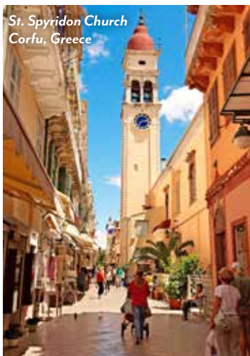
St. Spyridon Church Corfu, Greece

After breakfast, disembark the ship and transfer to the Athens Airport for your return flight home. (B)