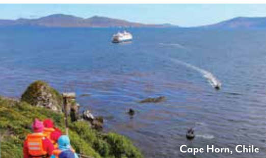
Cape Horn, Chile

While sailing toward Indonesia's fabled Spice Islands in 1520, Portuguese explorer Ferdinand Magellan became the first European to enter the channel that would later bear his name. Along the south side of the strait, amid the world's southernmost forests, smoke rose from numerous native Selk'nam campfires, leading Magellan to name this island Tierra del Humo, "land of smoke," which Spain's King Charles V changed to the more poetic Tierra del Fuego, "land of fire." The northern side of the strait came to be known as Patagonia, "land of giants," for Magellan and his men's impression of the tall, indigenous inhabitants. Three centuries later, the HMS Beagle, under the command of Admiral Robert FitzRoy and with young naturalist Charles Darwin on board, became the first ship to sail east to west through its namesake channel. Experience the same wonder of these intrepid explorers as you cruise through these mesmerizing landscapes almost untouched since Magellan explored them nearly 500 years ago.