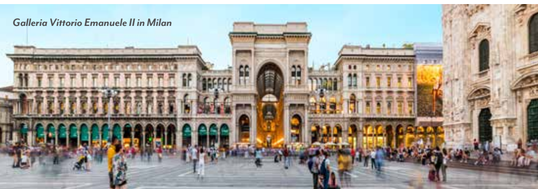
Galleria Vittorio Emanuele II in Milan