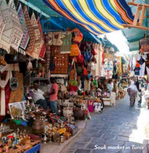
Souk market in Tunis