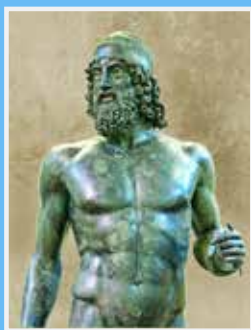
A Riace Bronze Statue