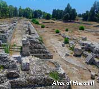
Altar of Hieron II

Centuries-old ruins beckon you to step into mythical pasts as sparkling turquoise waters ensconce pastel-hued towns and villages on this extraordinary itinerary. Each destination in Italy, Sicily, Malta, Tunisia, and Carthage reveals an intriguing history and distinct character—luring explorers, artists, architects, and powerful rulers for generations. The world's greatest empires are etched into every incomparable landscape and architectural triumph. It is a rare opportunity to see the diverse cultural legacies of the Italians, Greeks, Goths, Moors, Normans, Castilians, Turks, Jesuits, Spanish, and French come to life among timelessly spectacular scenery.