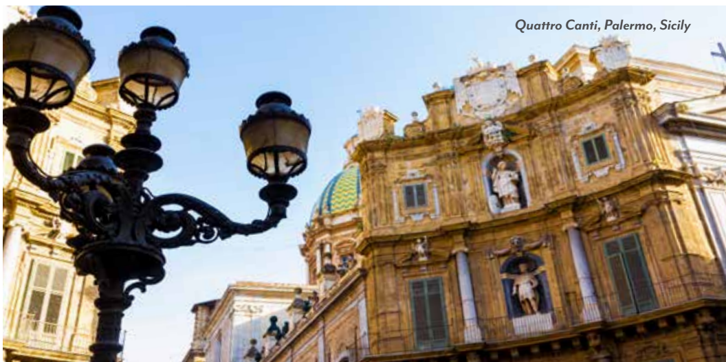
Quattro Canti, Palermo, Sicily

Enjoy breakfast on the ship and travel to the airport for your return flight home. (B)