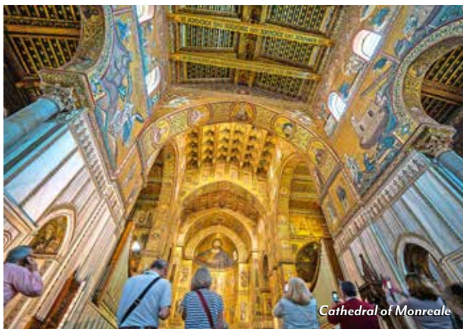
Cathedral of Monreale

of Trapani and continue to Segesta. See the ancient and well-preserved Doric Temple, with 36 gold limestone columns as well as an amphitheater still in use today. Visit the medieval town of Erice, set atop a hill surrounded by a lush park and accessible via cable car.