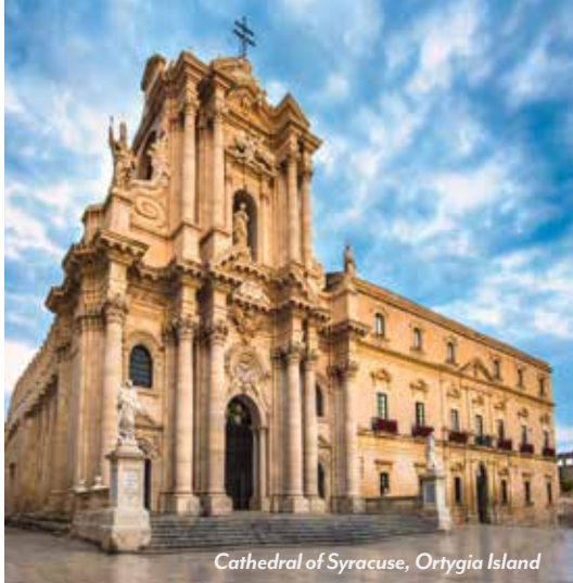
Cathedral of Syracuse, Ortygia Island

Islamic world. The capital has a history dating back to 200 B.C. Transfer to the UNESCO World Heritage Site of Carthage to visit the Baths of Antoninus, the ancient Roman theater, and the Punic ports where Carthaginian fleets once took shelter. See Tunis's historic center, the Arabic Medina or Old Town—also a UNESCO-inscribed site with a labyrinth of narrow alleyways, small shops, mosques, and palaces. Enjoy afternoon free time in the souks (markets) after an included lunch at a local restaurant near Medina. (B,L,D)