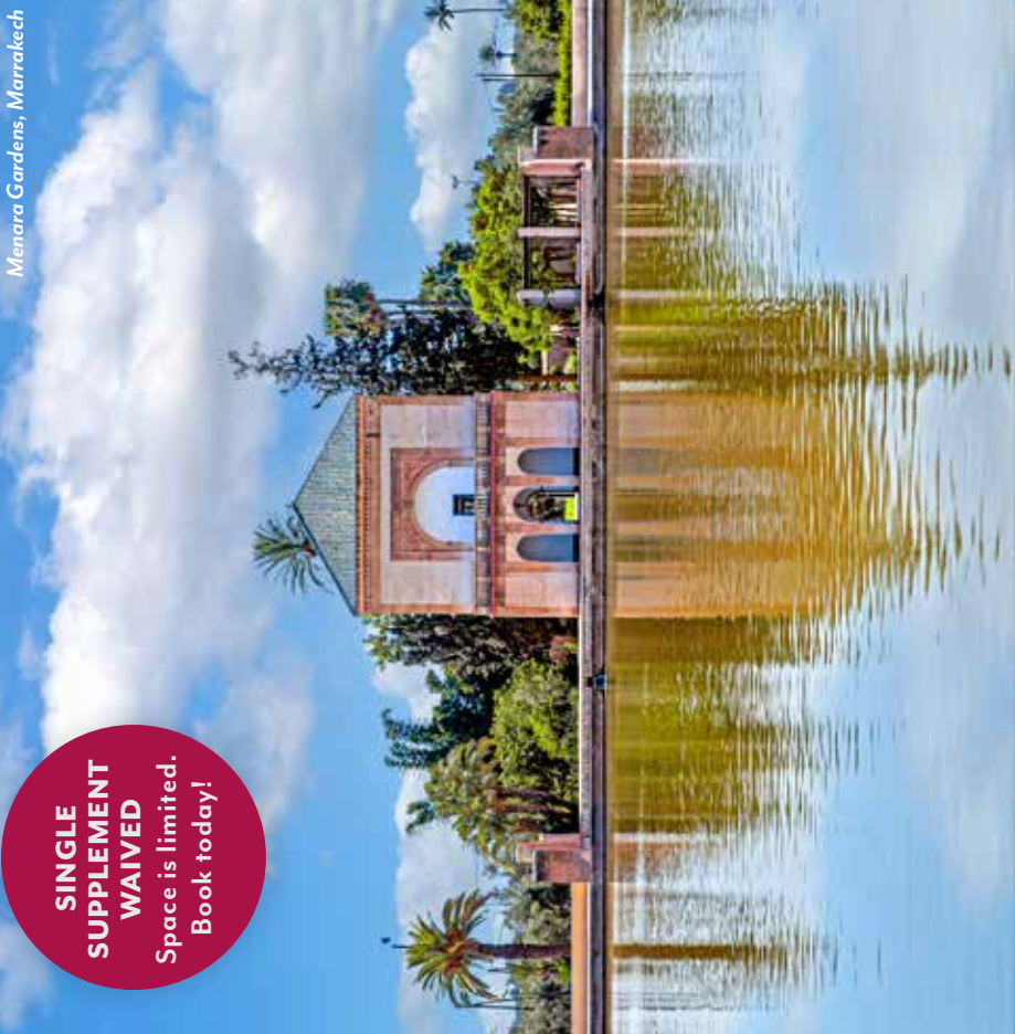
Menara Gardens, Marrakech

SPECIAL SAVINGS! Early Booking up to $3,2400 per couple, plus receive Bonus Savings if you pay in full at the time of booking! Call for details.