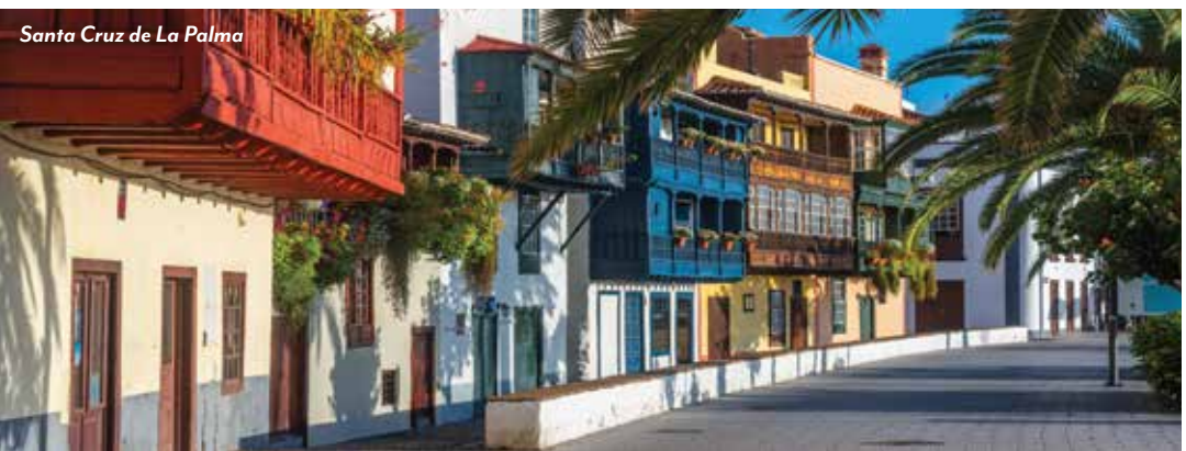
Santa Cruz de La Palma

Travel to the UNESCO World Heritage Site of Teide National Park, a wilderness of mineral-tinted rock, ancient lava flows, and distinctive vegetation not found anywhere else. Gaze across the vast caldera of Las Cañadas (dormant since 1909) to the snowy summit of Mount Teide and enjoy a panoramic view of the Roques de Garcia. After lunch at a local restaurant, visit the UNESCO-designated San Cristóbal de la Laguna, a beautiful university town established in 1496 that boasts rich history and extravagant architectural styles. Walk back in time as you stroll through the Moorish 17 th -century Canarian courtyards. (B,L,D)