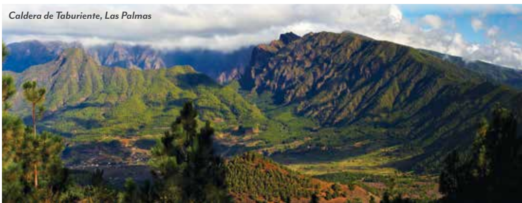
Caldera de Taburiente, Las Palmas

Disembark the ship and fly home or continue your journey with the Post-Program Option in Fez, Morocco. (B)