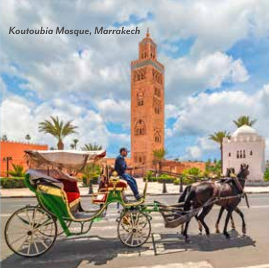
Koutoubia Mosque, Marrakech