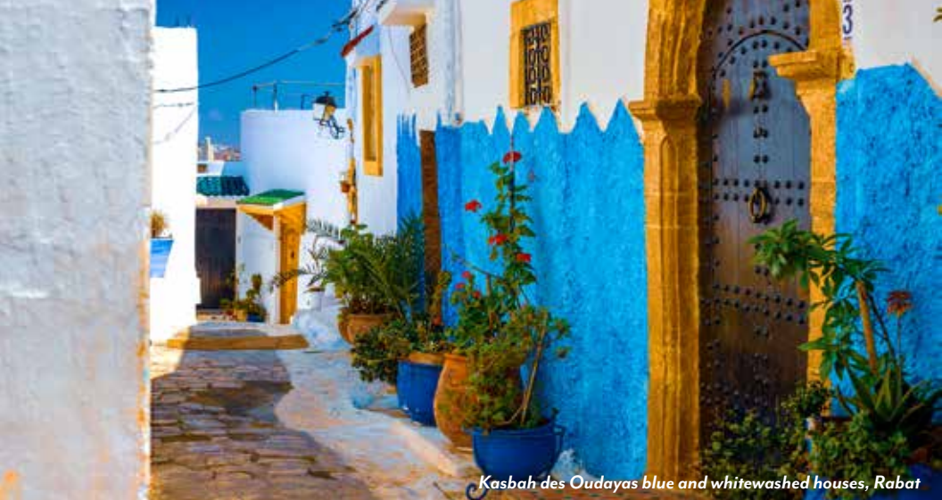
Kasbah des Oudayas blue and whitewashed houses, Rabat