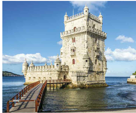
Tower of Belém