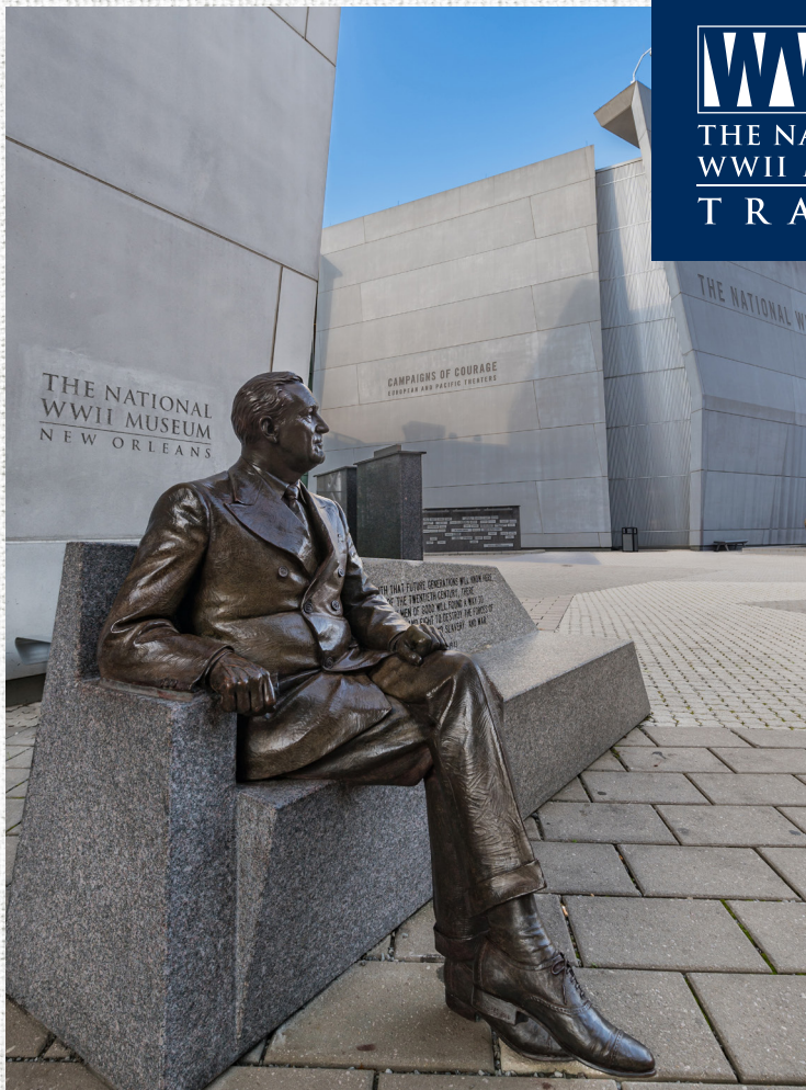
Tribute bench in honor of President Franklin Delano Roosevelt on Founders Plaza at The National WWII Museum.