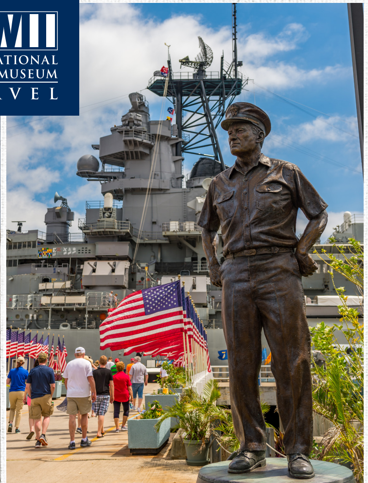
Statue of Admiral Chester W. Nimitz standing near the entrance to the USS Missouri.