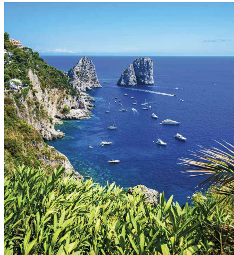
Isle of Capri