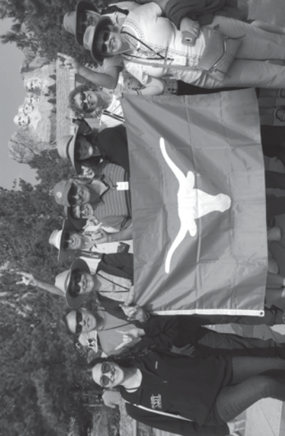
University of Texas alumni on Orbridge's Southwest National Parks 2018 travel program.

Special Alumni Rate: Save more than $800 per couple