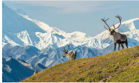
Denali National Park and Preserve