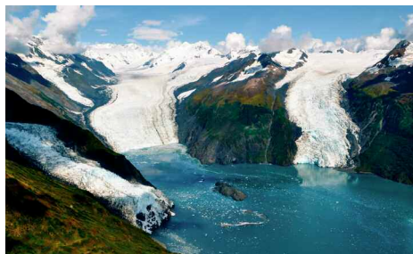
Kenai Peninsula, Prince William Sound