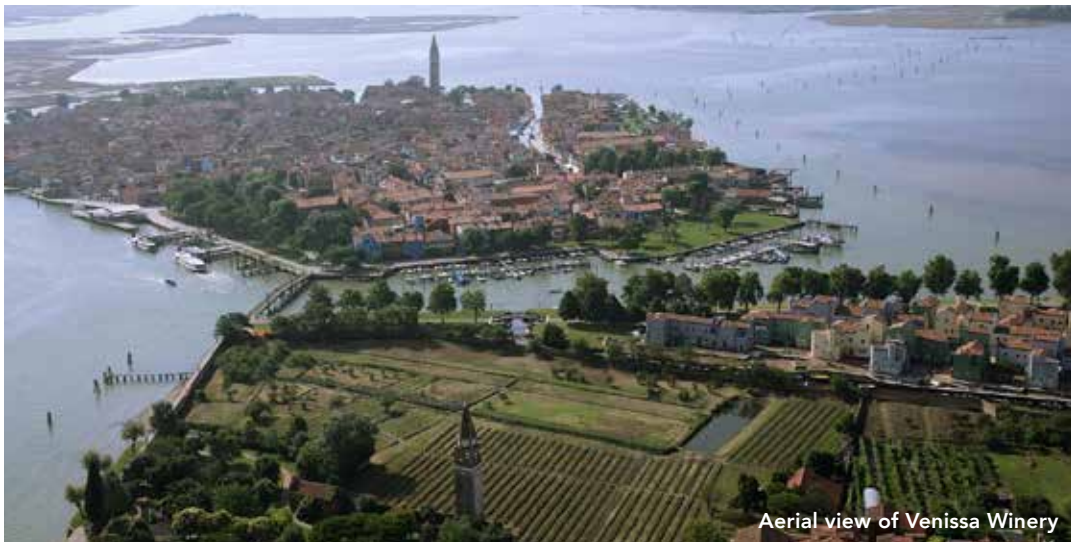
Aerial view of Venissa Winery