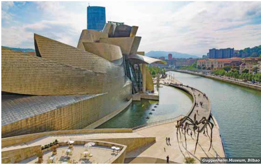
Guggenheim Museum, Bilbao