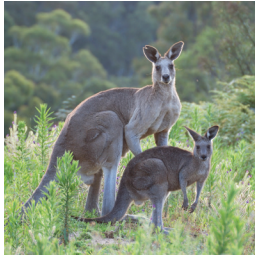
We may see kangaroos at Featherdale Wildlife Park.

Day 18: Queenstown/Rotorua We depart today for the Maori center of Rotorua, with its geysers, bubbling mud pools, and hot thermal springs. Our tour