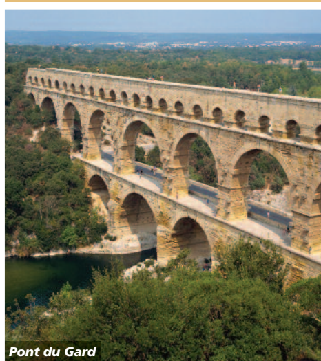
Pont du Gard