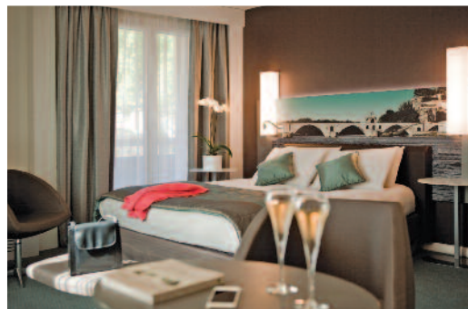
Mercure Pont d'Avignon Centre Hotel