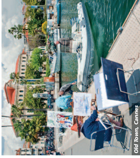
Old Town, Cannes