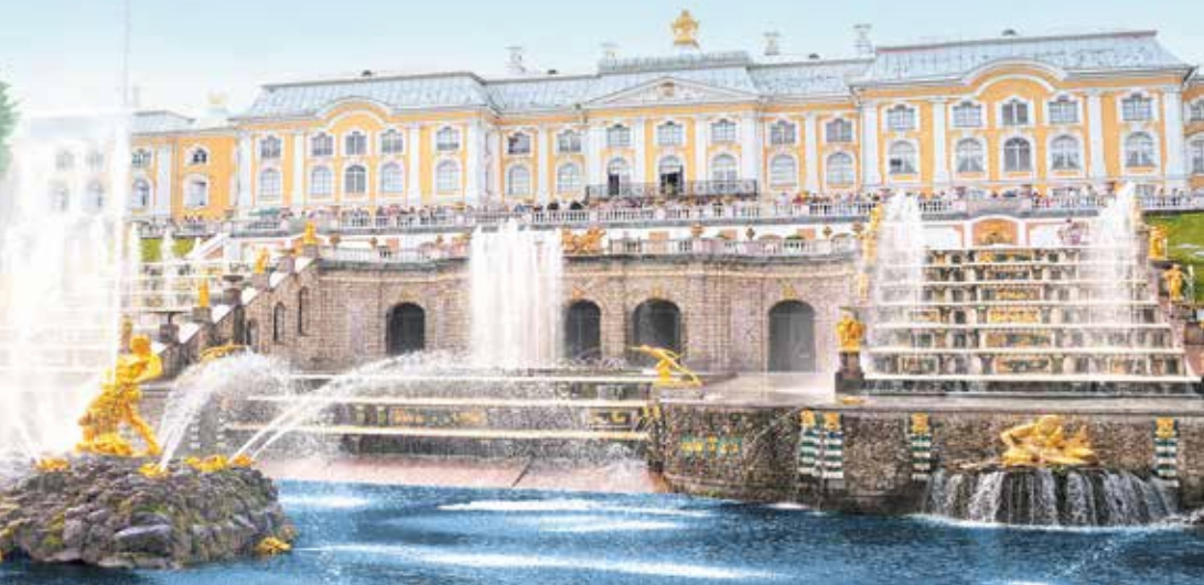
Photo this page: Peter the Great himself partially engineered the resplendent plexus of waterfalls, fountains and statues that adorn the foreground of the sumptuous Grand Palace at Petrodvorets.

Cover photo: Spanning 14 small islands where shimmering Lake Mälaren meets one of the largest archipelagos in the Baltic Sea, Stockholm balances medieval and Renaissance architecture with modern urban design.