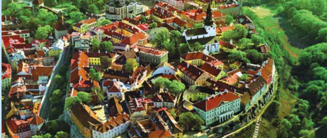
Tallinn, a hub of culture and commerce since the Hanseatic League, reflects its history in the 600-year-old spires and gables that define its picturesque skyline.

on Solidarity, globalization and progress in the region, with time for questions and answers.