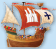
Hanseatic Cog Ship