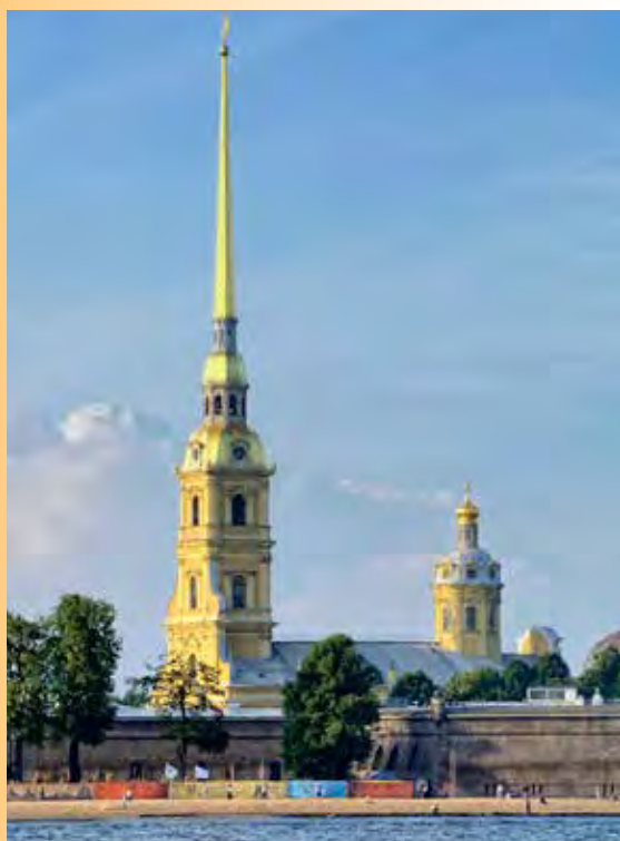
The Cathedral of Saints Peter and Paul was St. Petersburg's first building to be commissioned by Peter the Great in 1703.

Scheduled guest speakers may be altered due to circumstances beyond our control. See Release of Liability, Assumption of Risk and Binding Arbitration Agreement.