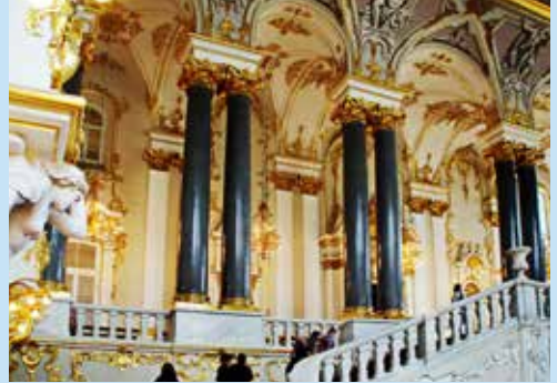
The State Hermitage Museum exhibits the artistic flourish of the era of Catherine the Great.

The panoramic tour of the historic city center, a UNESCO World Heritage site, features legendary landmarks scattered across more than 100 islands and linked by more than three times as many bridges. St. Petersburg's main thoroughfare, Nevsky Prospekt, showcases exquisite